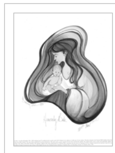
P. Buckley Moss Heavenly Babe 12"x13" unframed Limited Edition Print