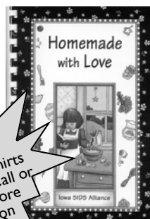
Cook Book 130 Pages, Spiralbound